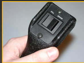
Fingertip Control Pendant